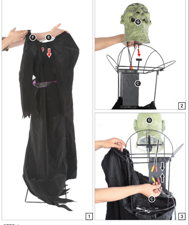
STEP 4 Place the (F) Costume over the (E) Shoulder Support and down over the assembled frame. The opening of the (F) Costume should be facing the back as shown in Figure 1. Lower the forked hook available on the (G) Head into the forked hook housing at the top of the (C) Torso Frame as shown in Figure 2. Connect the wires from the (G) Head to the corresponding cables available from the Control Box on the (C) Torso Frame as shown in Figure 3.