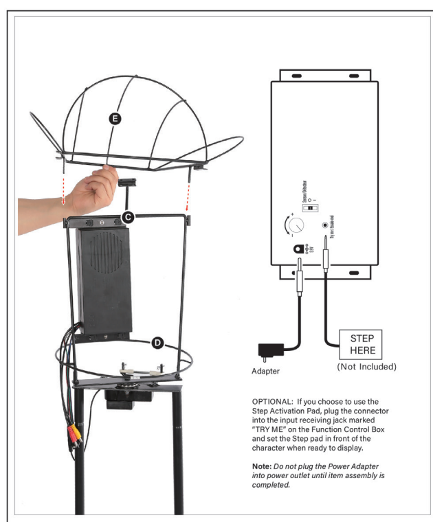
STEP 3 Do not plug the Adapter into power outlet until item assembly is completed. Now, Plug the Adapter into the input DC 5.9V on the function control box as shown. Slide the (E) Shoulder Support pegs into the housings available on the upper portion of the (C) Torso Frame

Secure the (C) Torso Frame to the (B) Support Poles by aligning the quick connect push buttons into the pre-drilled holes as shown in Figure 1. Then lower the pegs of the (D) Hip Hoop into the housings available on the lower portion of the (C) Torso frame as shown in Figure 2.