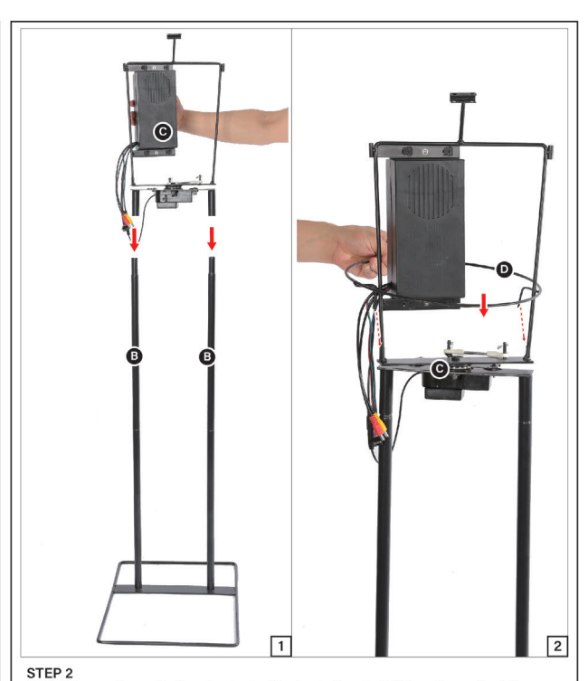
STEP 2 NOTE: The speaker on the Function Control Box located on the (C) Torso Frame should be facing front.

Secure 2 of the (B) Support Poles to the (A) Base by aligning the quick connect push buttons into the pre-drilled holes as shown in Figure 1. Then secure the remaining (B) Support Poles to the previously assembled support poles as shown in Figure 2.